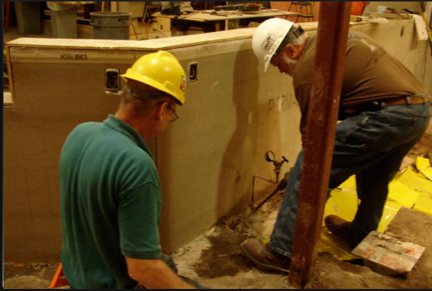
Redirecting the soda chase to enable it to come up underneath a relocated soda tower