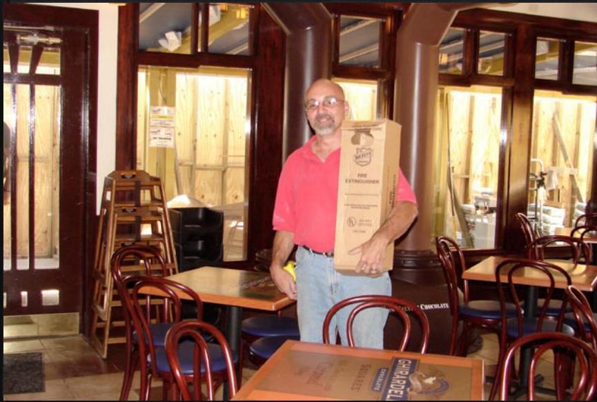
Putting the final touches on the job as opening day approaches