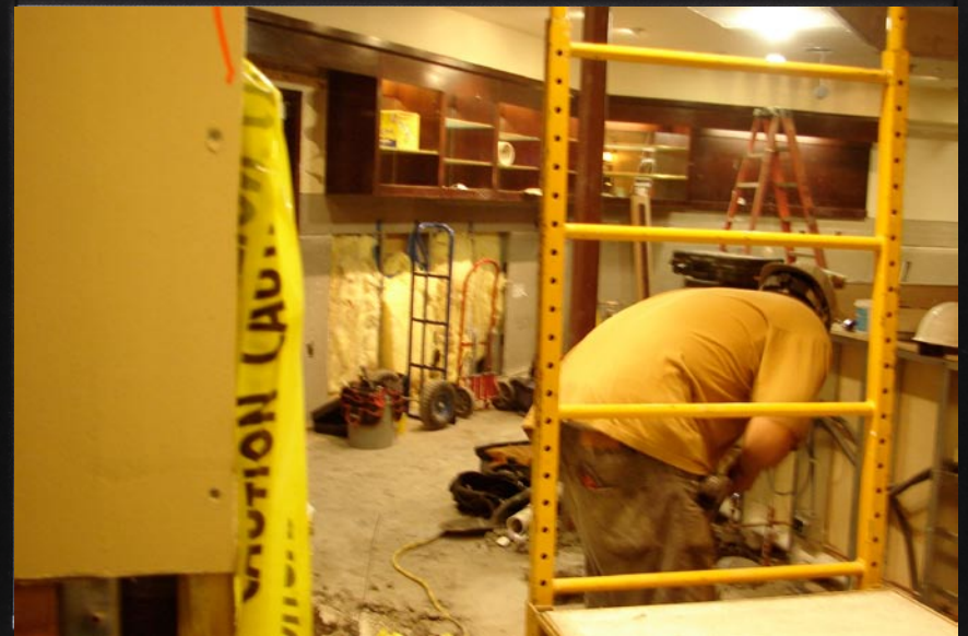
Remediation measures taken where necessary behind the Service Line, followed by insulation and Permabase