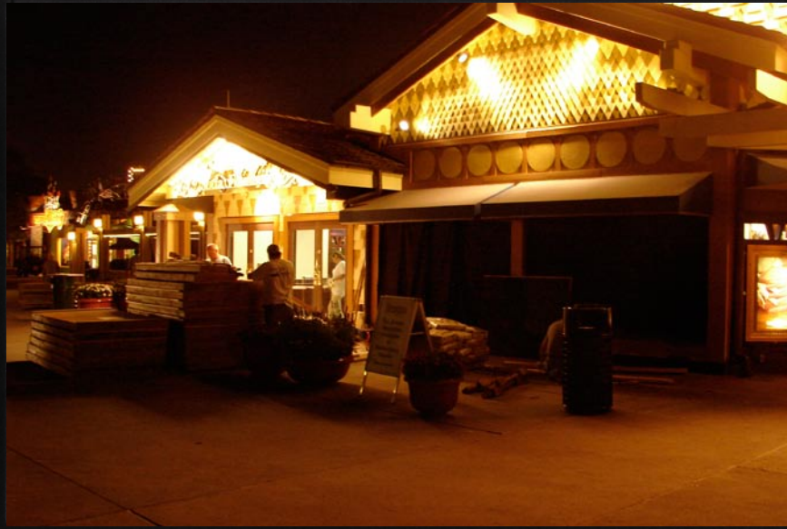
Removing the Dust Screen