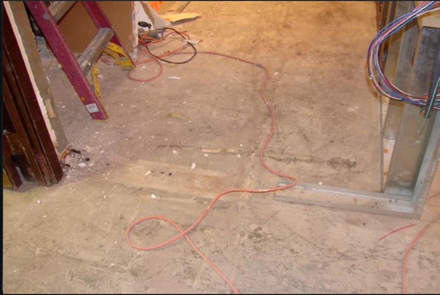
Re-working the wall by the Pass-Thru and Vestibule Areas leading to the Restrooms