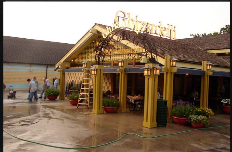
Doing a thorough clean-up around the building's exterior