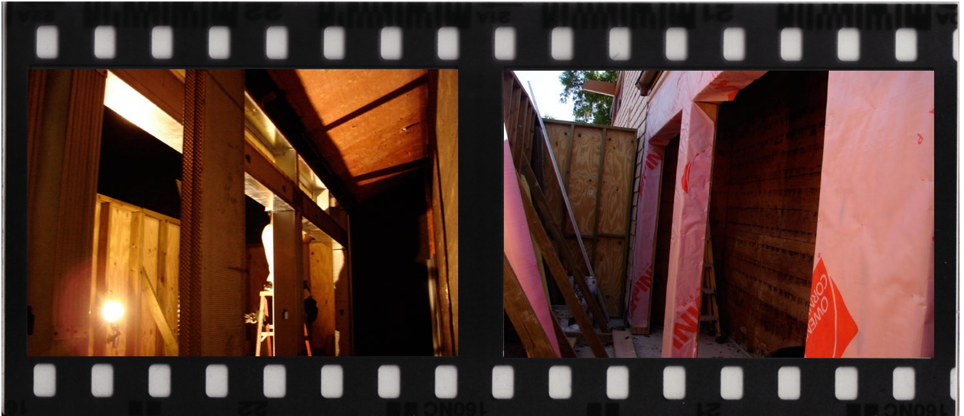
Working on the Storage Room at the back of the building