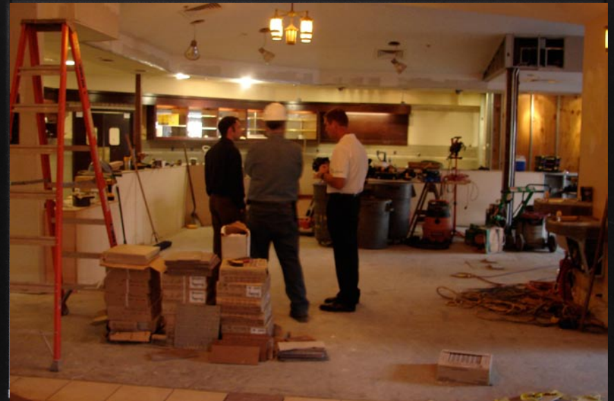
Meeting with a host of building officials and Disney managers