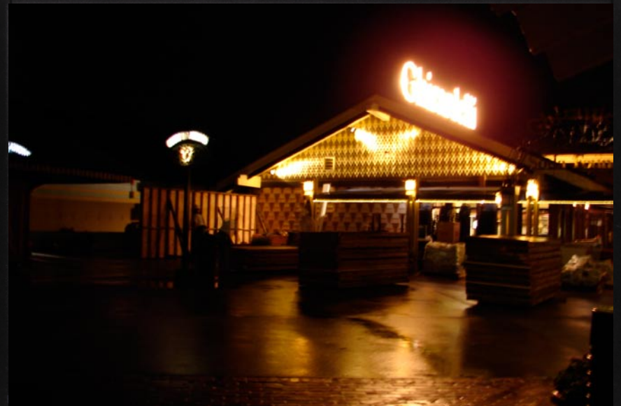
Setting up the Dust Screen