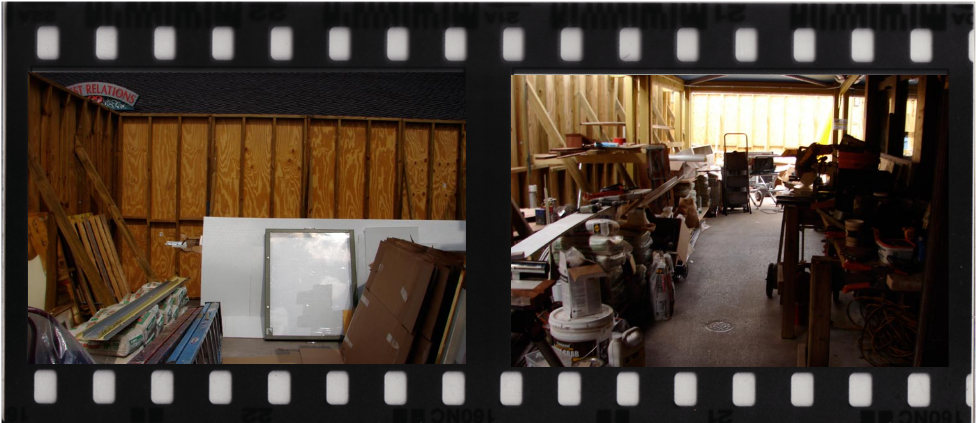
Storing materials and establishing work spaces behind the Dust Screen, which encompasses half of the building's envelope