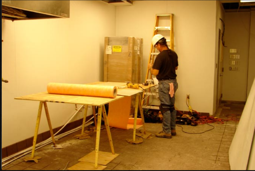
Installing a waterproof membrane at the baseline, which also received one-foot-deep concrete edging between the studs throughout the Dish Wash Area