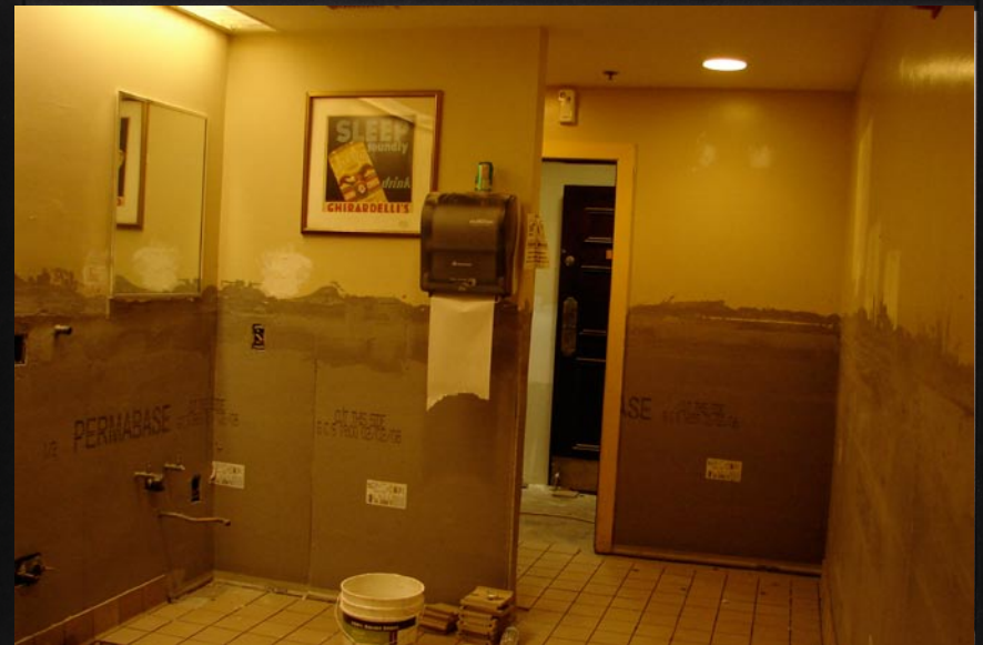
Hanging Permabase, setting ceramic and quarry tile, and repairing walls in the Men's and Women's Restrooms. Wallcovering followed.