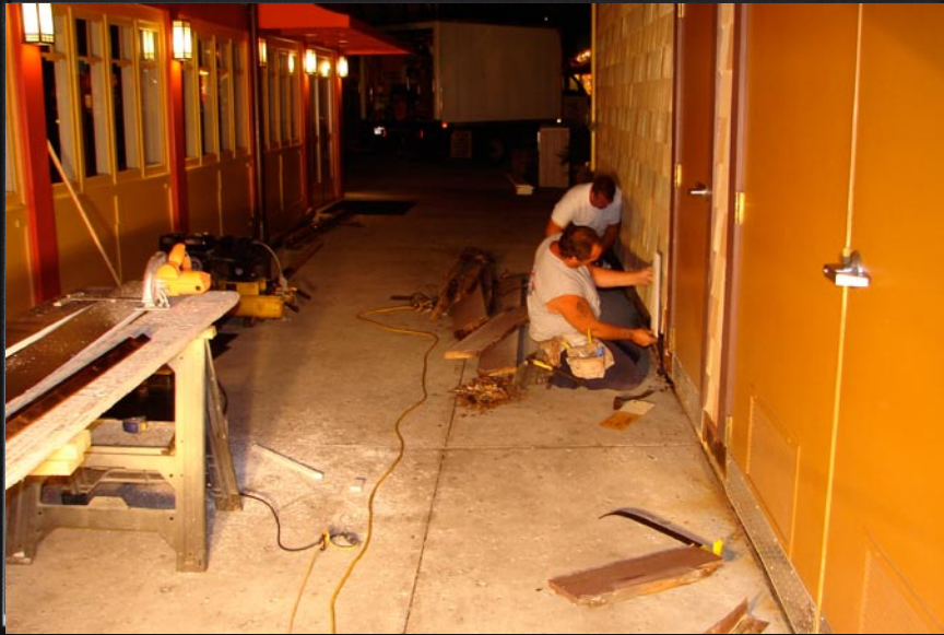
Replacing brittle shingles throughout the building's exterior