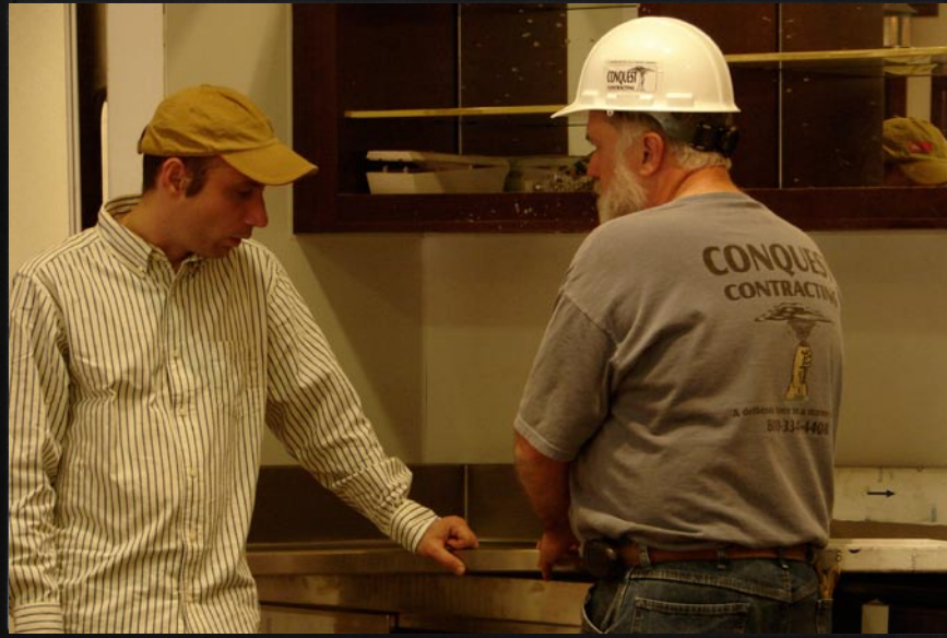
Conferring with our Client