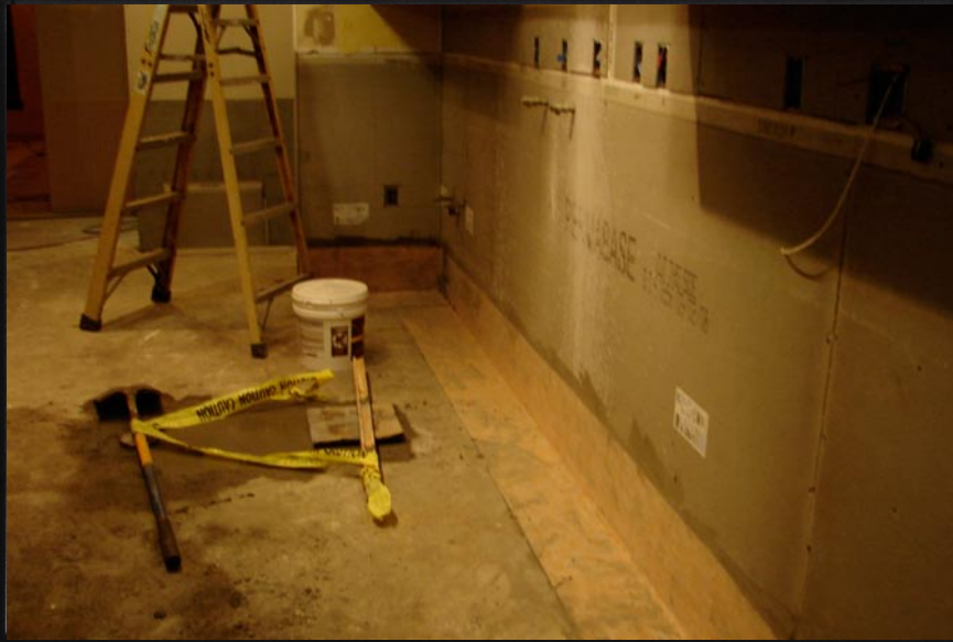
Installing a waterproof membrane behind the Service Line