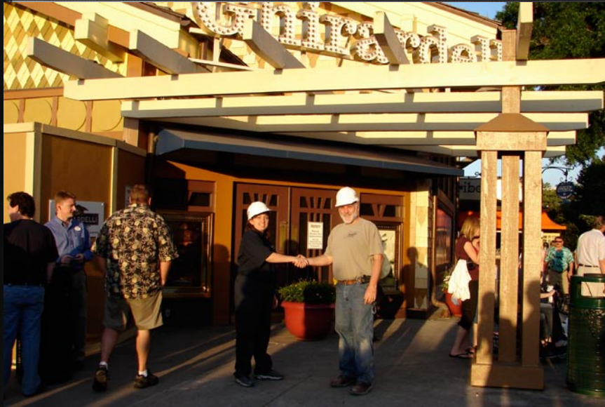
The doors open for business at the Retail Area on April 11