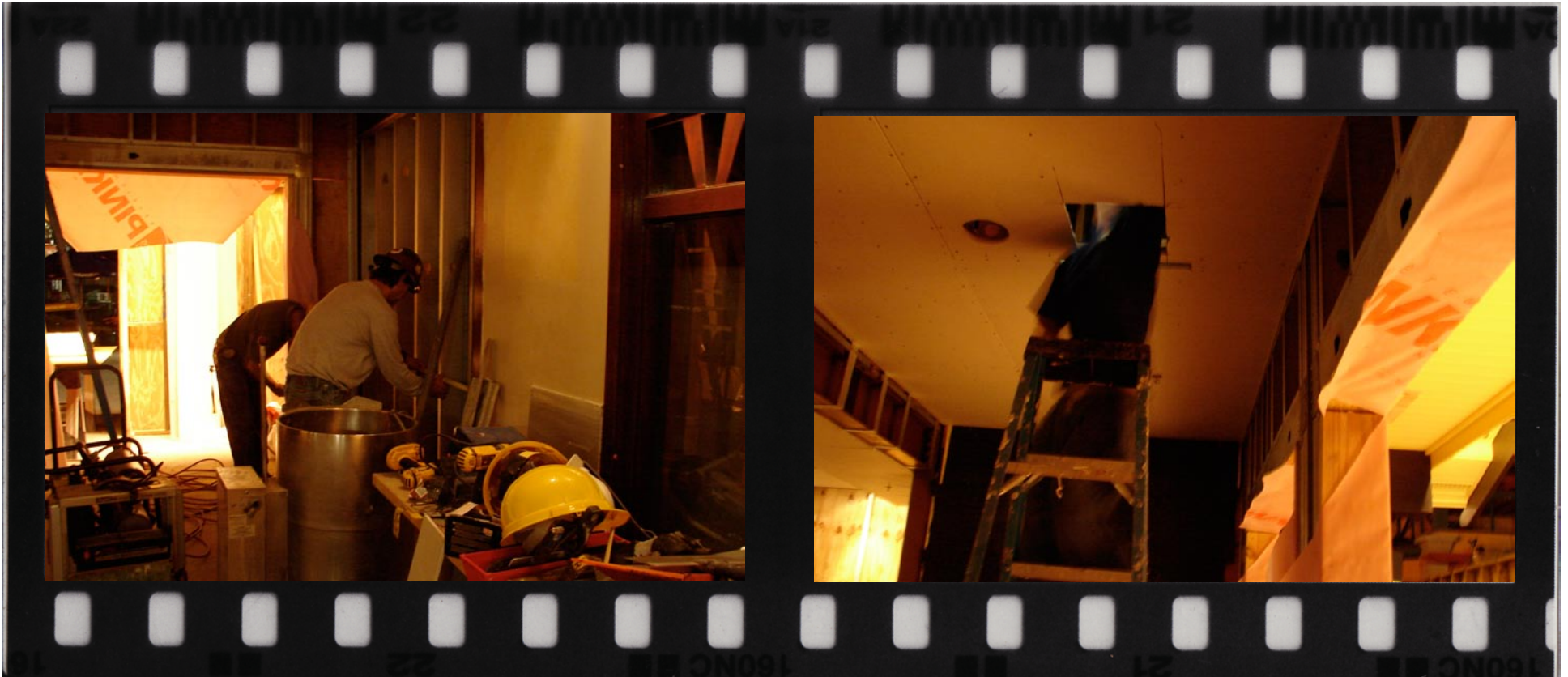
Building the New Addition at the Front of the House