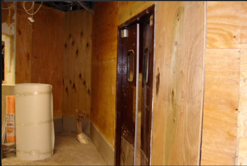
Readying the Back of the House for FRP. Ceiling repairs follow.