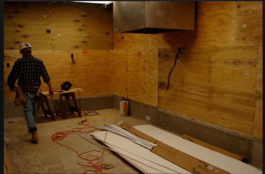
Sheathing the walls with plywood above the Permabase after taking remediation measures throughout the Dish Wash Area