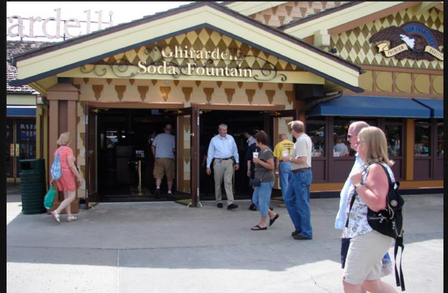
The doors open for business at the Soda Fountain on May 9