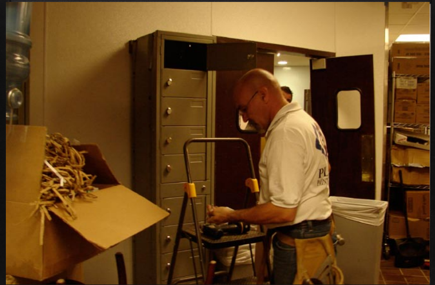
Being attentive to the needs of Ghirardelli management