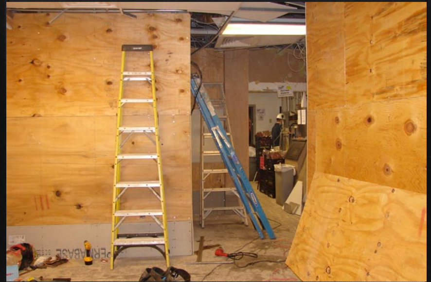
Running electrical wires to Disney's new water meter located inside the Boiler Room behind the structure -- an additional scope item