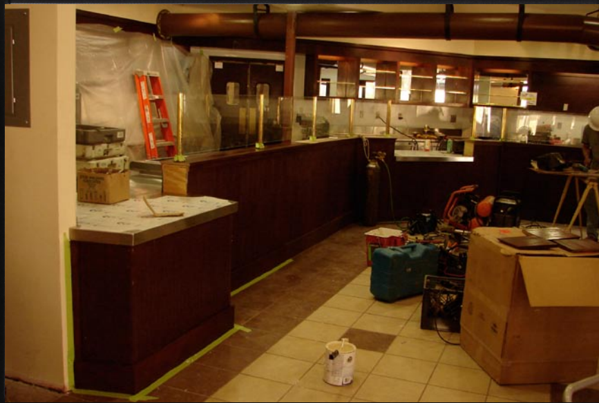
Installing the sneeze guard, as well as glass shelving inside the wood cabinetry, which received a refreshed finish