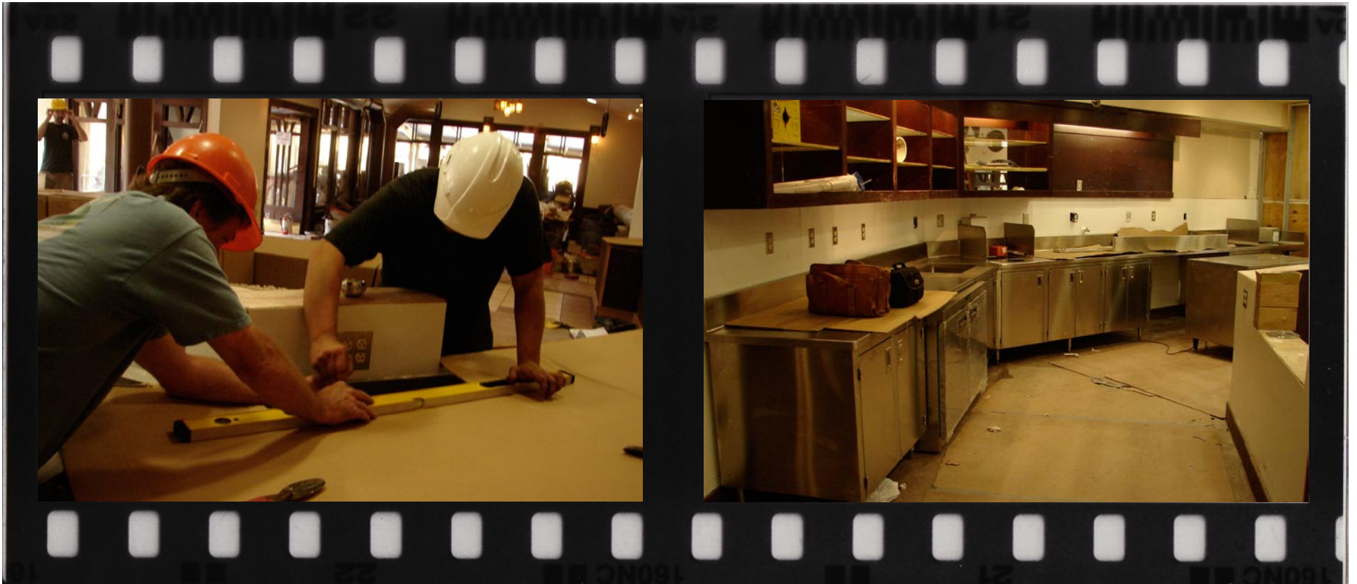
The stainless steel crew setting in their cabinetry