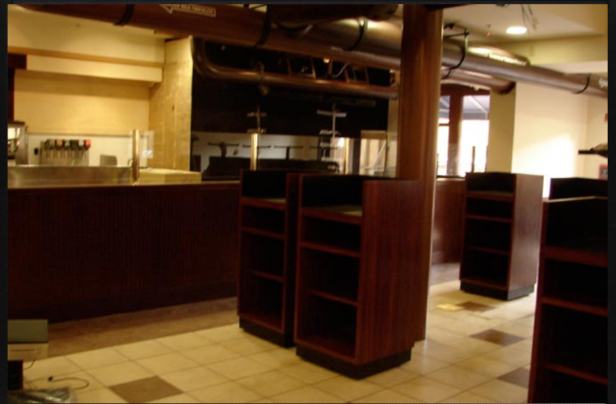
Setting up the new Point of Service stations