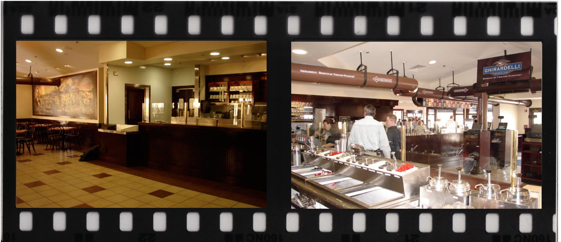
Getting the interior ready to receive guests