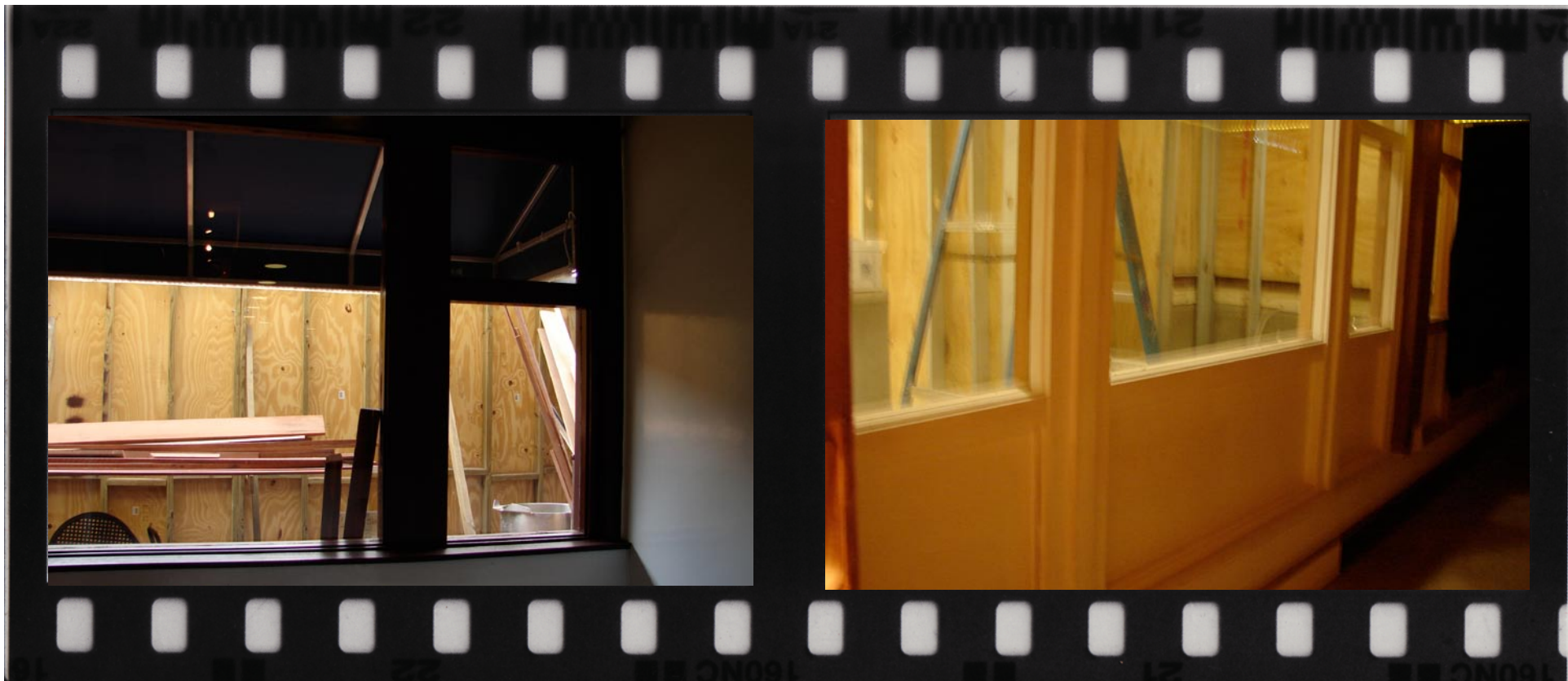
Replacing Mahogany window trim with the same