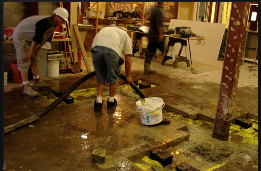
This concrete pour is for the Service Line and Point of Service Areas -- the latter area having received new electrical floor boxes as part of the additional scope items