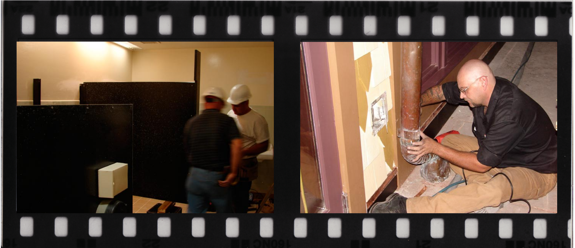
Re-installing the Restroom partitions