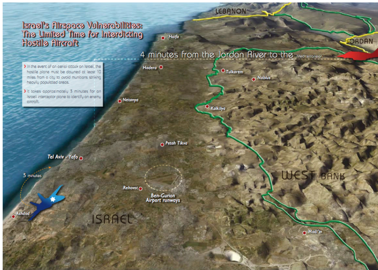
Map courtesy of Jerusalem Center for Public Affairs

United Nations peacekeeping forces would rapidly disappear, just as they did before hostilities erupted during the 1967 Six Day War. When they do decide to stay, they are ineffective, and even complicit, just like they were in 2006 in Lebanon when they turned a blind-eye to Hizb'allah positioning itself in close proximity to their observation post in order to fire on Israelis, even providing the Islamists with intelligence.